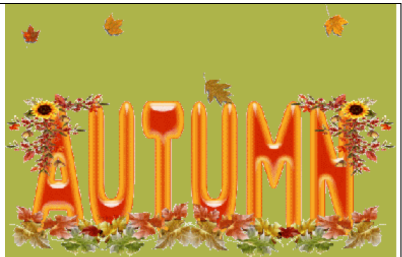
First day of Autumn is Thursday, September 22nd