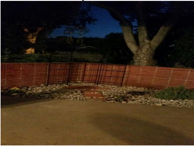
New Trellis and Stepping Stones