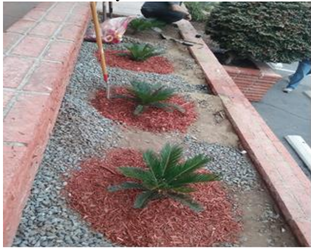
Renovation of side planter